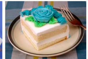
White Cake with Real Lemon Mousse Filling