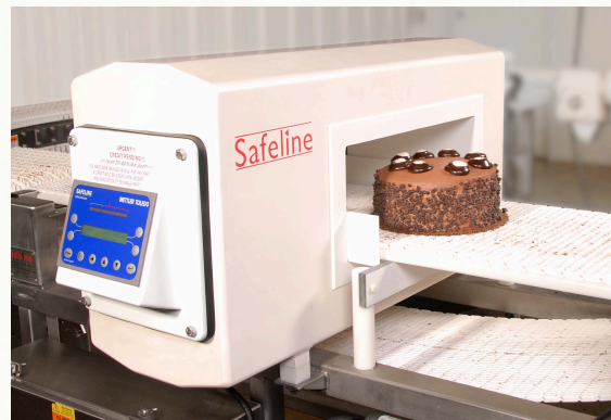
Every cake passes stringent Quality Assurance and H.A.C.C.P. tests.