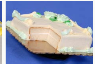
8x8 Square Split and Filled Vanilla Mousse Cake with Antique White Buttercream.