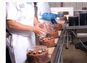
Each cake is packaged in a high visible dome or window box