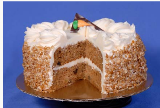
Carrot cake with Pineapple, Walnut and Golden Raisins Raisins and frosted with real cream cheese