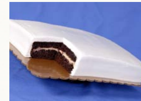
Base Iced and Mousse Filled Chocolate Cake with Buttercream.