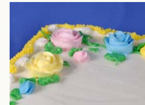
Our floral arrangements are all hand made and entirely edible