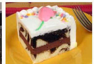
Marble Cake with Real Chocolate Mousse Filling